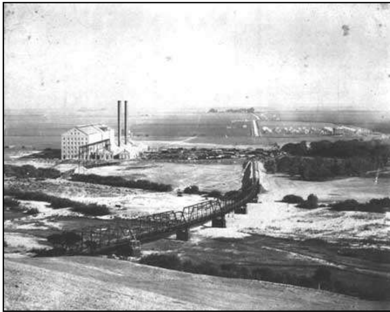
Figure 3. The largest sugar refinery in the world and the company town Spreckels in 1900.

Trust shares. 42 He then incorporated the newly formed Spreckels Sugar Company and became president of the group. 43