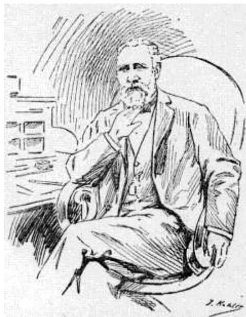
Figures 5 and 6. Portraits of Claus Spreckels, 1895.