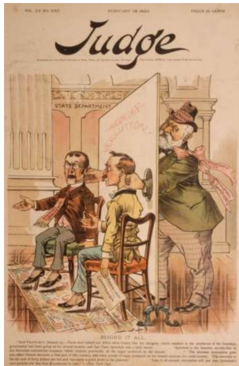
Figure 1. Influencing Politics: Claus Spreckels as puppeteer of the Hawaiian Commissioner and Commission. Caricature, 1893.

was not amused. 19 However, the Hawaiian sugar king still maintained a leading economic position until 1893. 20 The Hawaiian enterprise made Spreckels a multimillionaire with a fortune estimated at $12 to 25 million in the late 1880s. 21 He believed that he had “done more for that country than any living man,” a position supported by the U.S. government and many contemporaries. 22 Nevertheless, to make a fortune quickly, Spreckels had bolstered corruption and often bent the law, undermining his long-term economic prospects.